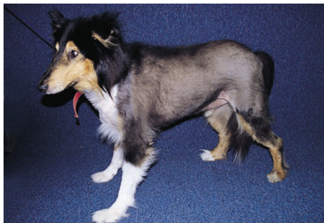
FIGURE 9-38 Canine Hypothyroidism. Generalized truncal alopecia in an adult collie.