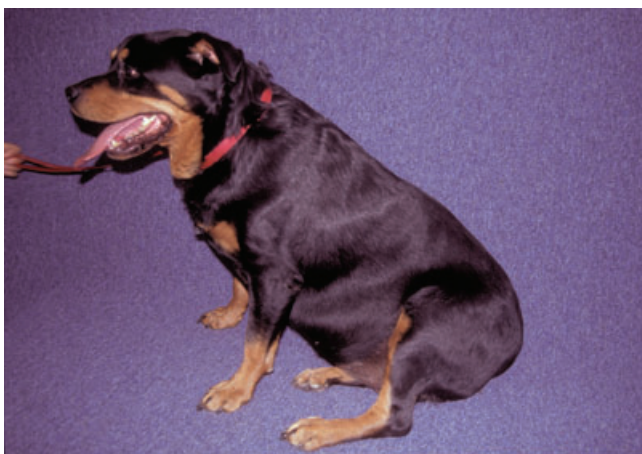
FIGURE 9-37 Canine Hypothyroidism. An obese Rottweiler with hypothyroidism. Note that the hair coat lacks the bilaterally symmetrical alopecia that is considered characteristic of this disease.