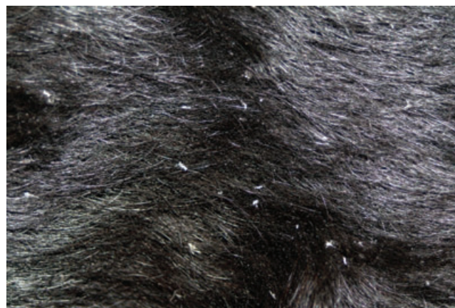
FIGURE 9-14 Canine Hyperadrenocorticism. Same dog as in Figure 9-12. Generalized seborrhea sicca can be secondary to numerous underlying diseases but was caused by hyperadrenocorticism in this dog.