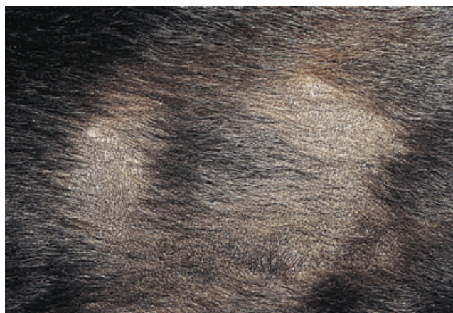
FIGURE 9-40 Canine Hypothyroidism. Alopecia and hyperpigmentation with no evidence of secondary superficial pyoderma on the trunk.