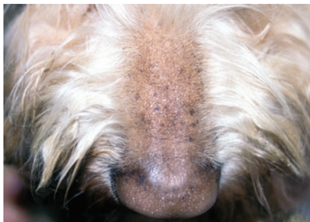
FIGURE 9-39 Canine Hypothyroidism. Mild alopecia on the bridge of the nose may be an early lesion of hypothyroidism.