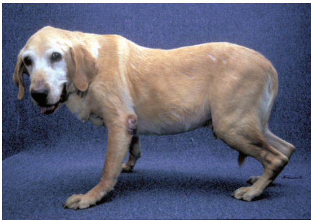
FIGURE 9-11 Canine Hyperadrenocorticism. An adult Labrador demonstrates the typical potbellied appearance. Generalized muscle wasting, which causes the abnormal posture, is also seen. Note that the hair coat is generally in good condition and does not demonstrate bilaterally symmetrical alopecia.